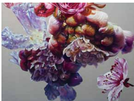
CLOCKWISE FROM LEFT Scabiosa Blossom; Red Tulip; Baroque Cherries III. All artworks: oil on Belgian linen, 96x126cm